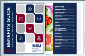
2025 Benefits Flipping Book