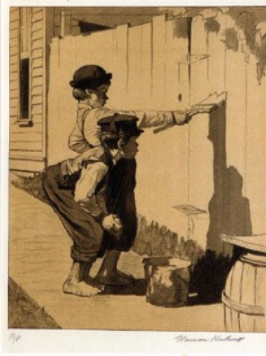
Tom Sawyer Whitewashing the Fence © MBI, INC/Heritage Press, 1936