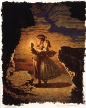
Tom and Becky in Cave